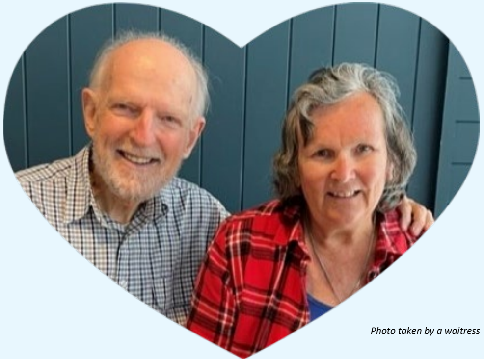
Photo taken by a waitress

Reflecting on the challenging events of the last few months, as well as the rest of my life to this point, I can only echo David's words in Psalm 23, verse 6: "Surely goodness and mercy will follow me all the days of my life."